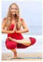
ABCs of IRAs for newbies