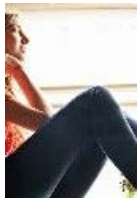
10 financial tips for young people