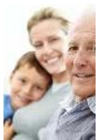
Bequeathing IRA to a trust