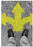
8 secrets of inherited IRAs