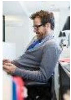
IRS rule helps investors