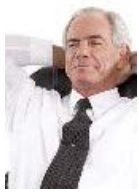
Will retirement disappoint you?