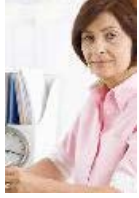
9 IRA secrets to know