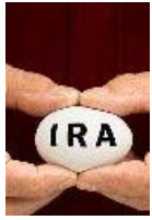
Know IRA loan rules