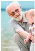
First steps for IRA investors