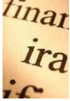
IRA a savings boon