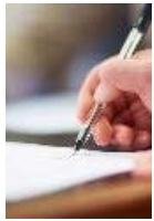
Where to open an IRA